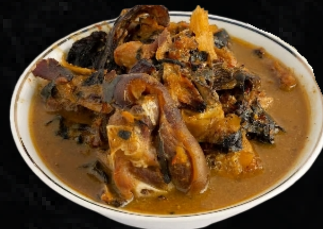
$30 NSALA SOUP