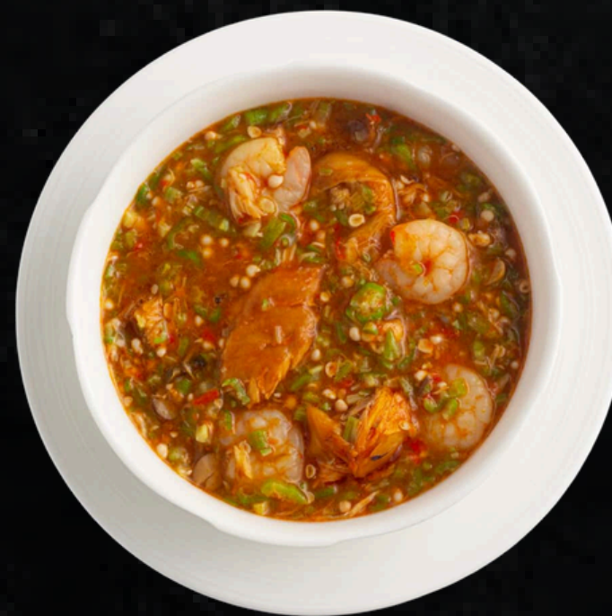
$30 OKRO/ ILA ALASEPO SOUP