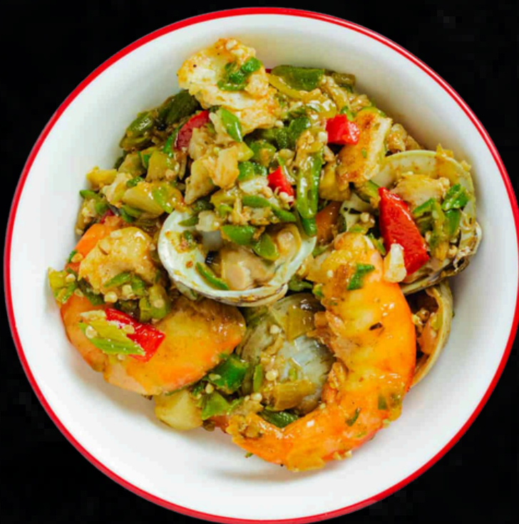
$35 SEA FOOD OKRO